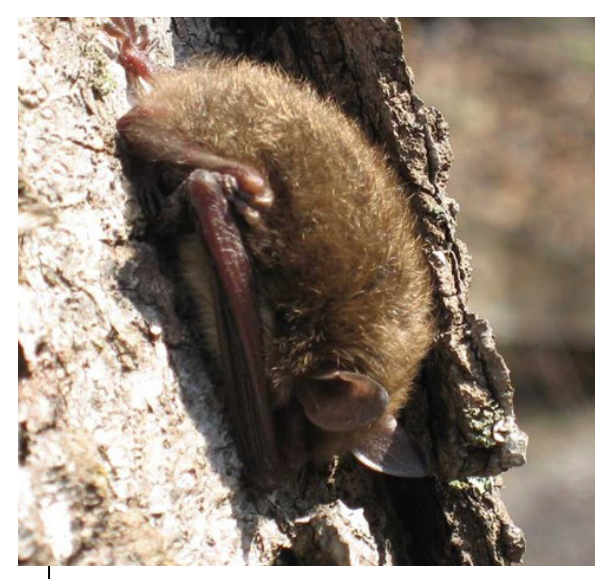
A bat tries to cover up and keep warm.