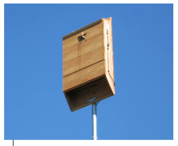
Houses on poles help bats find shelter.