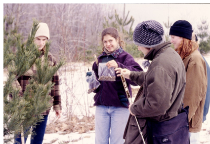
The pine woods were planted in 1990, and used for student biology research, pictured here in 1997.