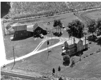
The Maxwell Farm, shown here in 1965, was purchased by Kenyon in the late 80's. BFEC student managers now live in the house, and the Kokosing Gap Trail follows the old tracks.