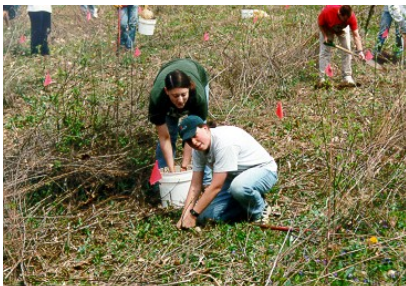
Students help plant thousands of trees along the Kokosing River.

He noted that there were a few small things in the initial plans that did