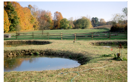
Ponds were constructed in 1999 for the study of aquatic biology. They now serve as home to seven species of frogs, and a place to explore food webs with elementary school field trips.