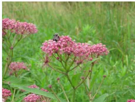
Swamp milkweed, a plant found at the BFEC wetland

A large wetland exists adjacent to Wolf Run within the portion of the BFEC preserve that lies north of Route 229. It is a relatively uncommon wetland type, a “wet meadow slope wetland”, so called because its main source of water is groundwater that emerges at the bottom of a hill that borders it to the east. Water flows very