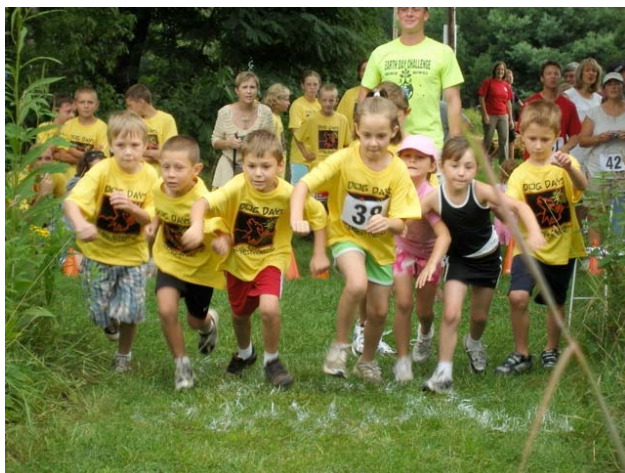
The August 2009 Dog Days Trail Running Festival

Wolf Run, expands on the Bishop's Backbone Loop. The second, parallel to the bike path, allows for a riverside loop hike... and the Kokosing Odyssey (see page 5).