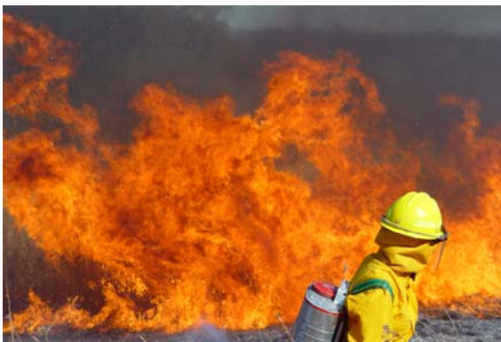
Pictured clockwise from top left: zebra swallowtail visiting purple cone-flower, a prairie flower; Indiangrass, which grows seven feet tall and fourteen feet deep; a certified volunteer monitoring the annual spring prairie burn.

agement a prairie would undergo succession to forest in a couple of decades or less. At the BFEC, we try to conduct controlled burns once a year, in late March or early April. These burns are done with the planning and supervision of trained people (don't attempt this at home!). We have to wait for just the right combination of dryness of plants, air temperature, moderate wind and correct wind direction. We also obtain permits from the OEPA and the Ohio Division of Forestry, notify local police and fire departments, file a detailed plan for the burn, and organize a crew of volunteers to monitor and manage the fire. Once the main fire is set, though, only running out of fuel will stop the burn (which is why we make sure the edges do not have fuel).